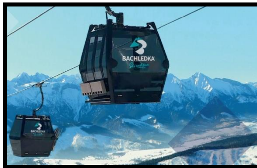
S K I I N G